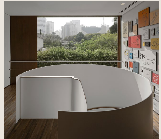
Levitating spiral staircase, Casa Cubo (São Paulo)