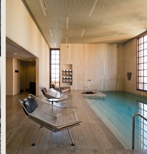
Clockwise: Fasano Las Piedras; Hotel Fasano São Paulo; detail from a Weinfeld credenza

boarding, instead of eating the hideous food that is served.