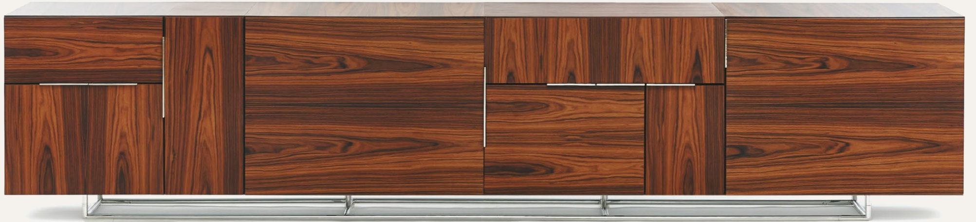
Domino Credenza by Isay Weinfeld for Geiger