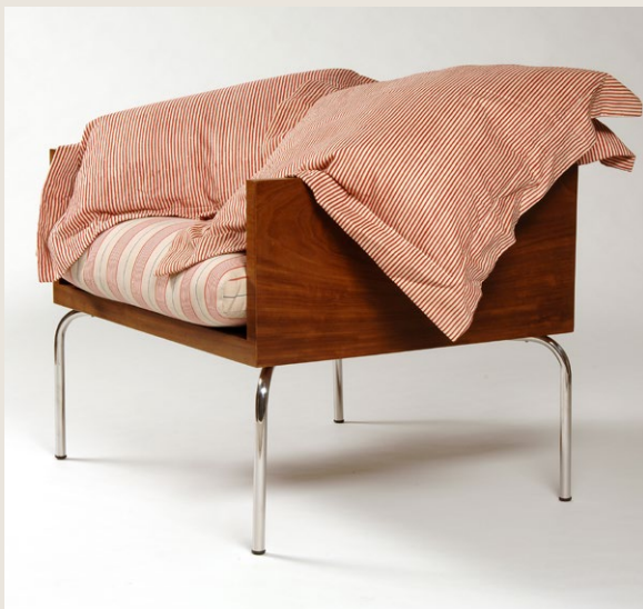
A Weinfeld-designed chair

To some, luxury may be buying a first-class ticket. To me, it is gobbling down a quarter pounder with cheese at the airport before