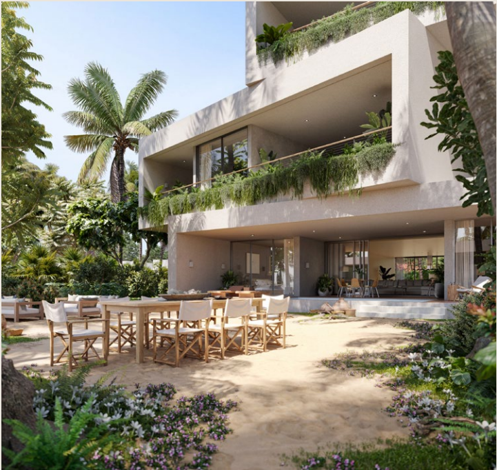
Beach Flats at Four Seasons Resort and Residences Dominican Republic at Tropicalia