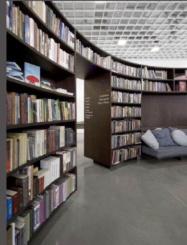
Casa Geneses (l) and Livraria da Vila (r). Fasano Hotel at Fazenda Boa Vista (opposite).