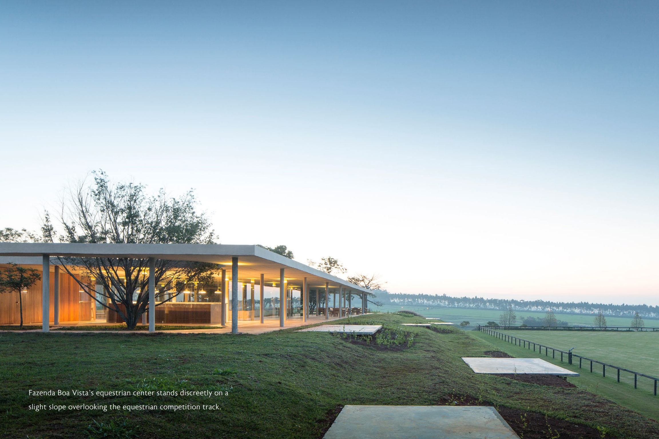
Fazenda Boa Vista's equestrian center stands discreetly on a slight slope overlooking the equestrian competition track.